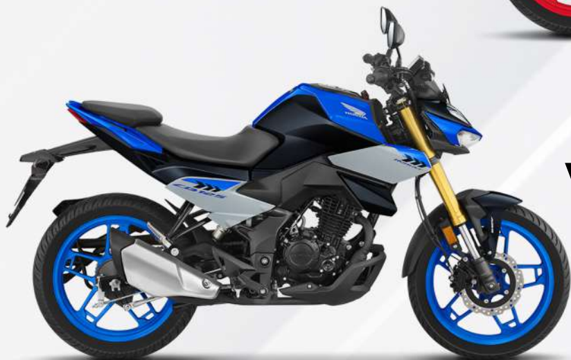
Pearl Siren Blue with Athletic Blue Metallic