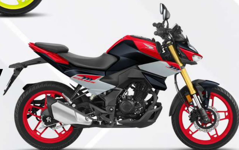
Pearl Siren Blue with Sports Red