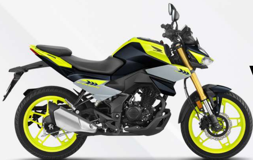
Pearl Siren Blue with Lemon Ice Yellow